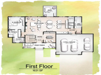
First Floor 1631 SF