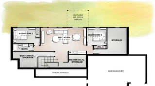
Basement 953 Finished SF