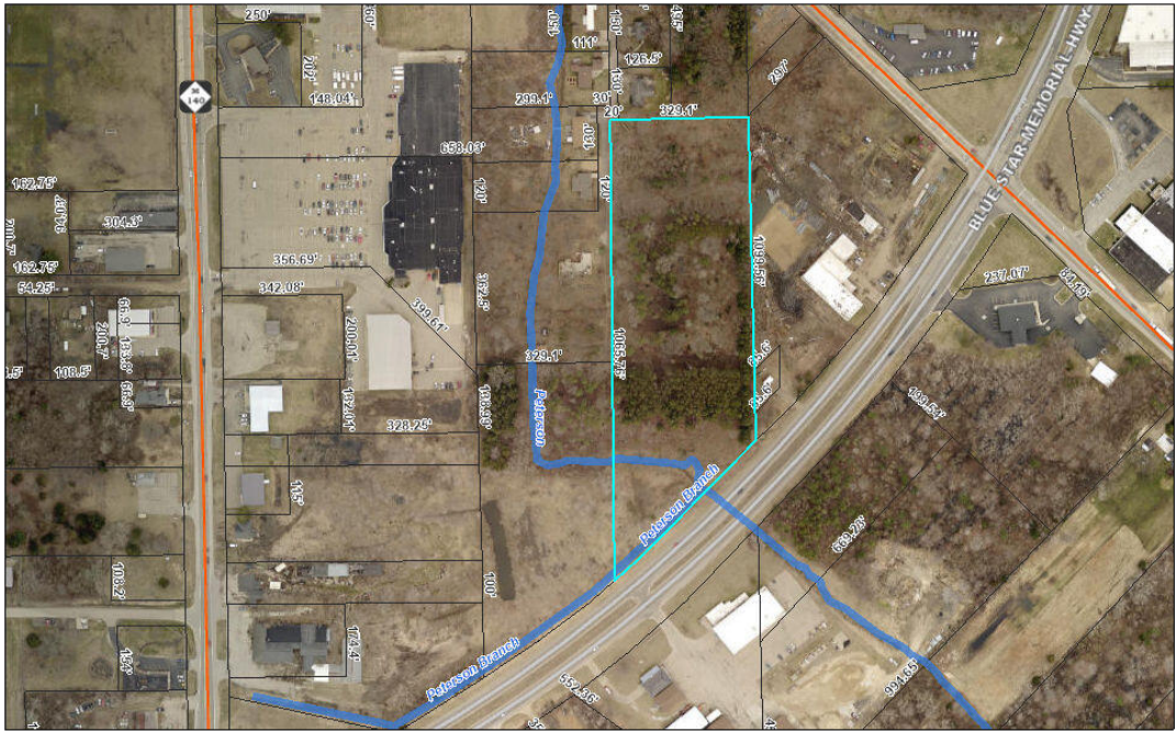
Van Buren County Parcel Record