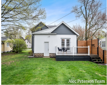
Alec Peterson Team

Welcome to 107 W Main Avenue! This charming 3-bedroom, 2.5-bath home offers nearly 1,800 sq ft of living space, blending timeless 1920 character with modern amenities, all in the heart of Downtown Zeeland. Step inside to an inviting, light-filled living area featuring durable laminate wood flooring. The main-floor owner's suite provides comfort and convenience with [...]