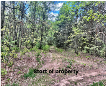
Start of property