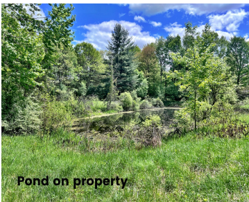
Pond on property