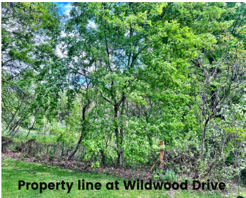
Property line at Wildwood Drive