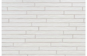
Fireplace Ceramic Tile Surround

SW 7032 Warm Stone Boot Bench, Office & Fireplace mantle Paint Color