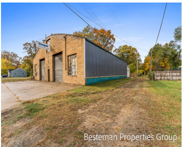
Besteman Properties Group

Large, solid building and a great location just off Apple Ave on Gordon St in Muskegon Township! US 31 and Apple Ave makes this an easy commute for many. This former service shop/tire store has 5,016 sq ft, two stories, three overhead doors, 0.28 acres of land, and other various features that may be perfect [...]