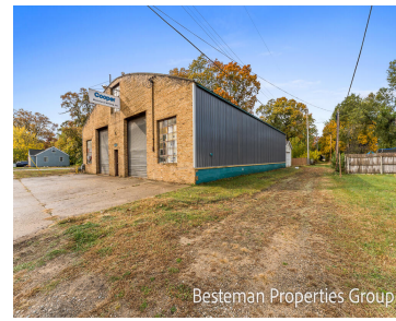
Besteman Properties Group