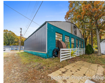
Besteman Properties Group