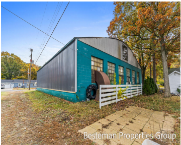
Besteman Properties Group