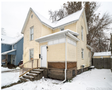
112 E GREEN ST - GROUND FLOOR