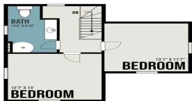
112 E GREEN ST - SECOND FLOOR