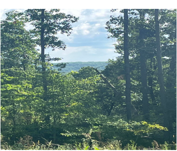
Parcel 9 – Premier Residential Development In The Grand Rapids Area, This 28 Acre Tract Of Land Has over 1200 feet of Private Flat River Frontage With Fly Fishing And Kayaking Virtually Out Your Back Door. These Large, Executive Home Sites Range From 1 To 2.7 Acres and offer Heavily Wooded Topography, Panoramic Views, Gated [...]