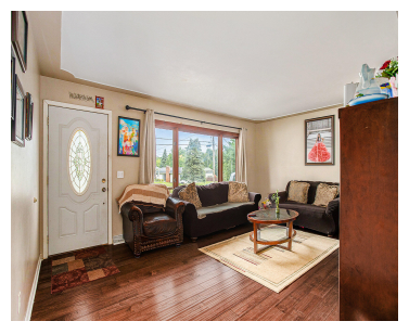
Charming 4-5 Bedroom Home in Pennfield School District. Welcome to your new home in a highly desirable neighborhood. This spacious property features 4 to 5 bedrooms and 2.5 bathrooms, perfect those who need extra space. Full Finished Basement Includes an egress window in 4th bedroom. Open Kitchen Door seamlessly connects to the family room, where [...]