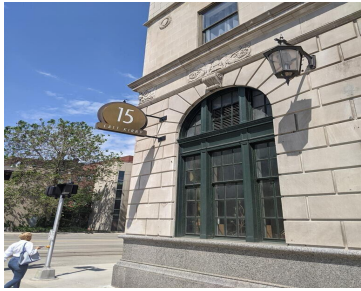
15 East Kirby Street, Detroit, MI, USA