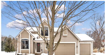
The Santa Center Team