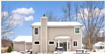
The Santa Center Team