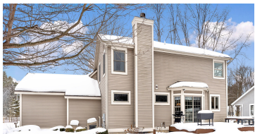
The Santa Center Team

Welcome to 15233 Rannes Street. This meticulously maintained 4-bedroom, 3.5 bath home offers over 2,800sq ft of finished living space and sits on nearly 1/2 acre, providing a rare combination of space and privacy. From the moment you step inside, the care and attention to detail are evident, making this home truly move-in ready. The [...]