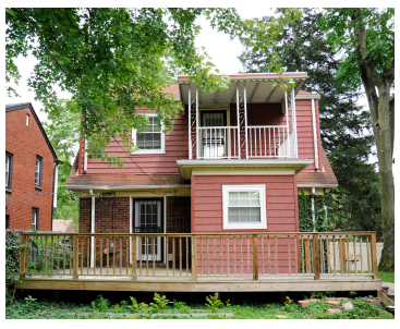
Well cared for double lot property on Evergreen