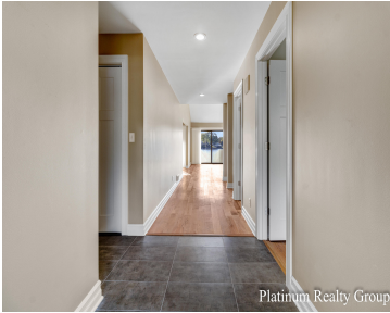
Platinum Realty Group

Discover Waterfront Serenity in the exclusive Prospect Point Condominiums, this home offers unparalleled waterfront living on the shimmering shores of Spring Lake. This meticulously updated 3-bedroom, 3-bathroom retreat spans 2,148 square feet of sophisticated comfort, blending modern elegance with timeless natural beauty. Recently refreshed with premium upgrades, it's the perfect haven for those seeking relaxation, [...]