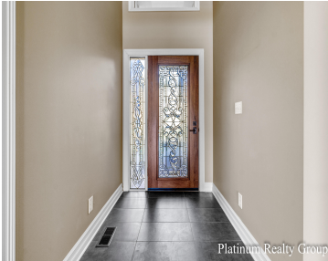
Platinum Realty Group