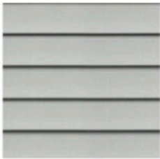
Smokestone Siding Color with White Trim