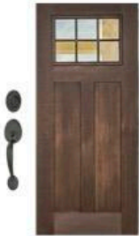
Coffee Dark Stained Front Door with Black Handleset