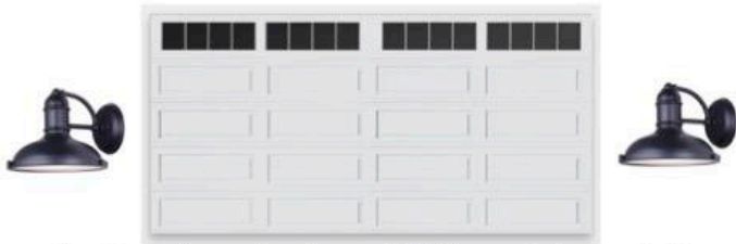
White Garage Doors with windows and Black Exterior Lights on each side