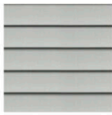
Smokestone Siding Color with White Trim