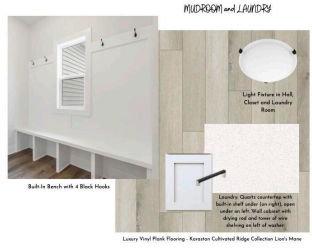
Bathroom and Laundry Bath to Bench with a Black Hook Light Fixture in Hall, Closets and Laundry Room Lanark - Quartz Countertop with White Wall and Under (on right) open shelving on left. Wall color with white drapery and wall color of white drapery on left of vanity. Lanark Vinyl Plank Flooring - Karsten Coloured Ridge Collection Lock-Mat