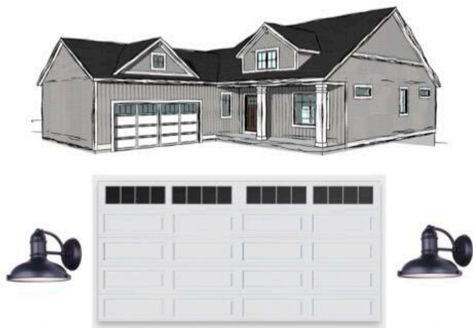
White Garage Doors with windows and Black Exterior Lights on each side