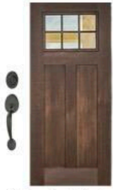
Coffee Dark Stained Front Door with Black Handleset