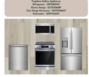
Frigidaire Gallery Appliances Refrigerator - GRFS5853AF Electric Range - GCES3960BF Over Range Microwave - GMCS1962AF Dishwasher - GDFP4525AF

This new construction Ranch Style home was built by the Award Winning Baumann Team! Featuring just over 1,500 square feet, main floor laundry, 2 bedrooms, 2 full baths, Cathedral ceilings, spacious master suite with walk in closet and dual sinks. You will love the ease of main level living! This open concept home features stainless [...]