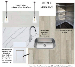
KITCHEN & DINING ROOM 3 Mixed Pots and 2 Use Lights in Dining Room Walter Green Cabinet with Black/White Mixed Hardware. Colosseum Stone Quartz Countertop with Travertine Stone A&B Tile Stainless Steel Undermount Sink with Strainless Faucet 4-Shape Wire Shelving in Pantry Lanark Vinyl Plank Flooring - Karsten Coloured Ridge Collection Lock-Mat