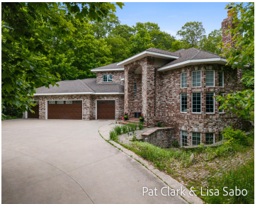
Pat Clark & Lisa Sabo

Stunning custom brick estate in exclusive Mountain Plat Gated Community. Discover this exquisite 4-bedroom, 5-full bathroom custom built home, nestled on 5+ private wooded acres. Boasting over 5,000 sq. ft. of meticulously designed living space, this residence offers an unparalleled blend of elegance and comfort. From the grand entryway to the spacious, light filled interiors, [...]