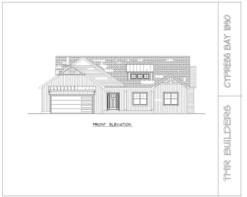
TMR BUILDERS CYPRESS BAY 1890