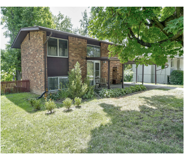
"Home Energy Score of 7 . Download report at stream.a2gov.org