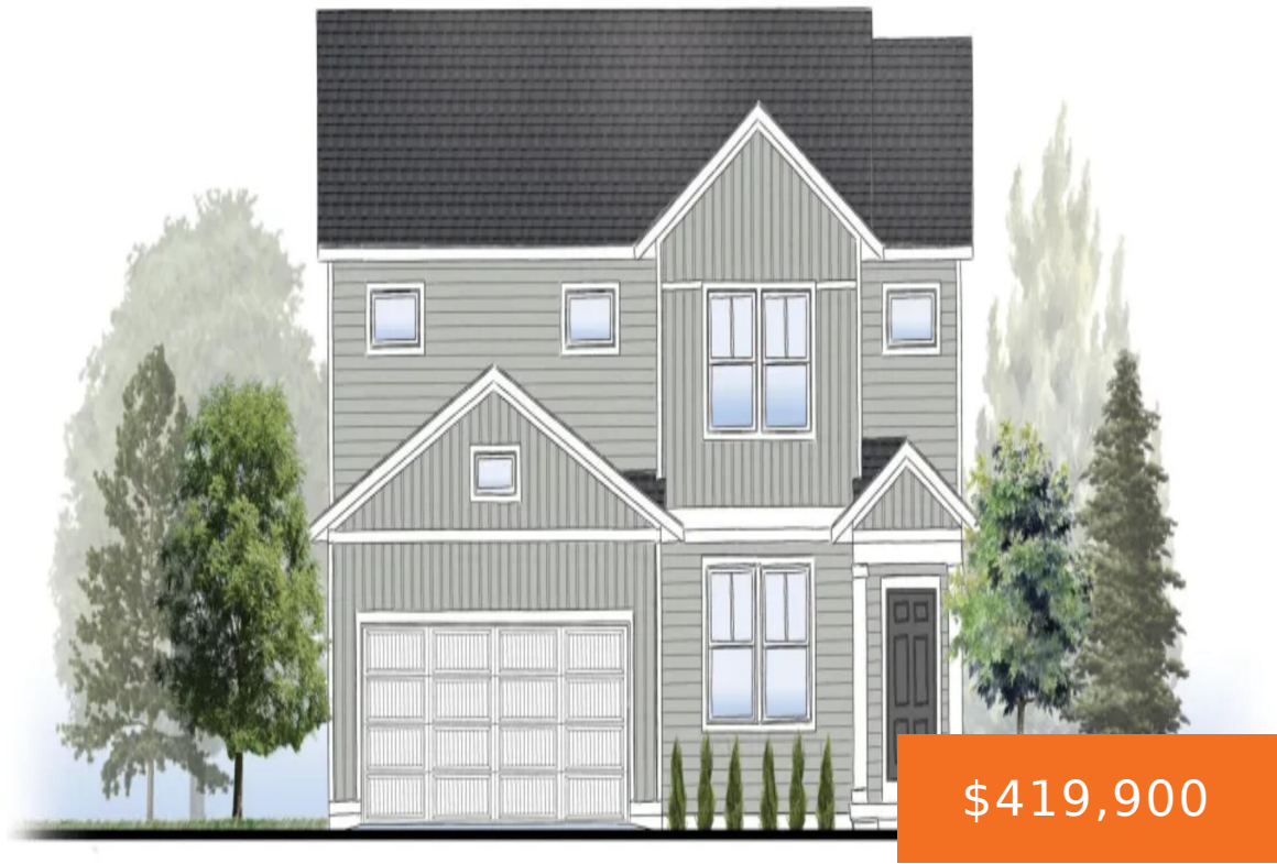
Ashton - Elevation A