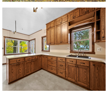
Outside: 2.25 level acres with an insulated, wired pole building and a wood burner. New septic and drain field in 2024. Inside: You'll discover beautifully crafted wood cabinets and newer flooring with in-floor heat! Never suffer through a power outage as this home is equipped with oil lamps for off-grid lighting. New windows & insulation [...]