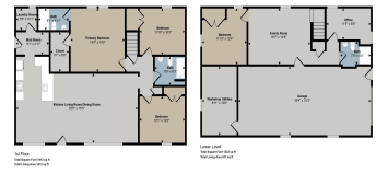
Basement Total Square Foot 1000 sq ft Total Living Area 600 sq ft

Lower Level Total Square Foot 1332 sq ft Total Living Area 611 sq ft