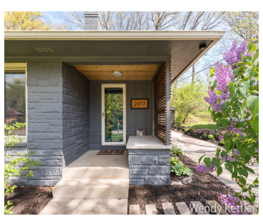
Open 5/10 1-3: Welcome to this beautifully updated 4-bed, 2-bath home in the highly sought-after East Grand Rapids School District. This prime location allows easy walkability to Reeds Lake, schools, shopping, and restaurants in Gaslight Village and Breton Village. Inside, you'll discover a modern, inviting interior featuring an updated kitchen with stainless steel appliances. The [...]