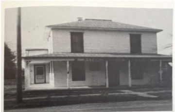
M. Alice Chapin Memorial Library and Museum on corner of Pickard and Fourth Streets served the community from 1954 to 1986.