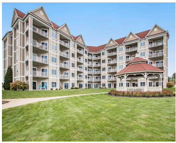
224 LAKESIDE DR