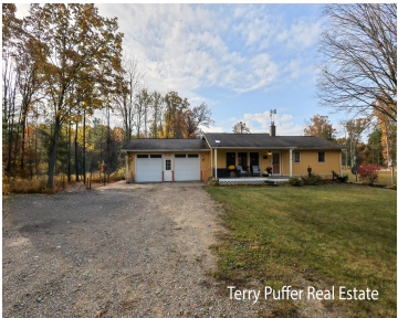
Terry Puffer Real Estate

Welcome to your private retreat! This stunning 4-bed, 3-bath home is nestled on nearly 70 acres, offering endless possibilities for recreation, relaxation & country living. Enjoy summer days by the 24×32 in-ground pool, explore scenic trails and Betts Creek running through the property, or take advantage of the impressive 40×44 barn with lean-to's on each [...]