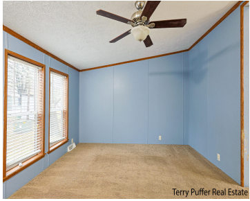
Terry Puffer Real Estate