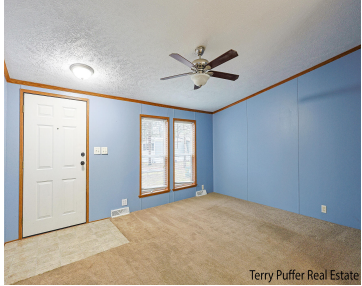
Terry Puffer Real Estate

This privately-owned mobile home community is as friendly as it is inviting, offering convenient access to all the amenities you need. Perfect for first-time homebuyers, those looking to downsize, or anyone seeking single-level living, this home is priced to sell! Built in 1999, this Four Seasons mobile home features 3 bedrooms and 2 bathrooms. While [...]