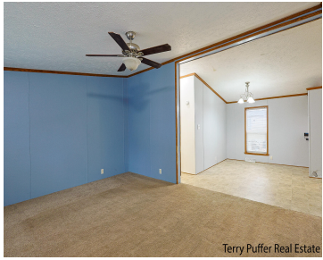
Terry Puffer Real Estate