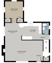
1st FLOOR Chatham Sq 25, 1928 Year Bld: 17, 210