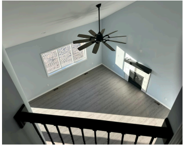
Mapleton Floor Plan, Elevation C, w/ 3 Car Garage