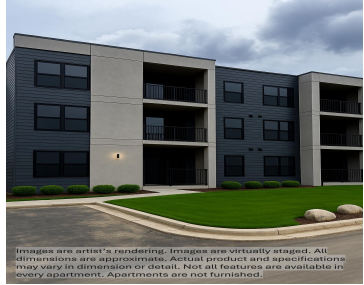
Images are artist's rendering. Images are virtually staged. All dimensions are approximate. Actual product and specifications may vary in dimension or detail. Not all features are available in every apartment. Apartments are not furnished.