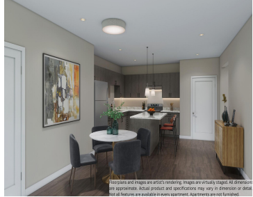
Floorplans and images are artist's rendering. Images are virtually staged. All dimensions are approximate. Actual product and specifications may vary in dimension or detail. Not all features are available in every apartment. Apartments are not furnished.

Welcome to Brightdown Village, a brand-new apartment community thoughtfully designed to combine contemporary style with a welcoming atmosphere. Each apartment is built with comfort and convenience in mind, featuring brand-new appliances, elegant vinyl plank flooring, and stunning granite countertops. With an in-unit washer and dryer, daily chores are effortless, and every unit includes a private [...]