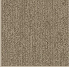
Carpet Dwelling Seapoint Tanglewood loop pattern