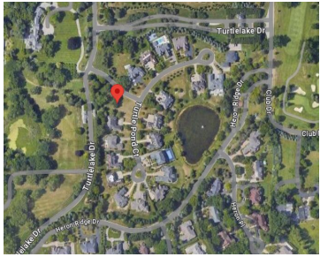
2944 TURTLE POND Drive Bloomfield Twp, MI 48302-0725