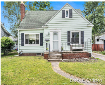
Brock E Carlston

Charming and move-in ready! This beautifully maintained 3-bedroom, 2-bath home features numerous updates, including new vinyl windows (2022), added insulation for year-round comfort, and gleaming refinished hardwood floors. The upstairs bathroom has been tastefully remodeled and includes luxurious heated floors. Enjoy peace of mind with a new water heater (2022) and a furnace (2018). Additional [...]