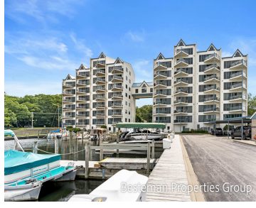
Besteman Properties Group