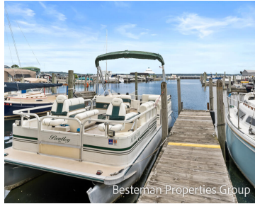
Besteman Properties Group