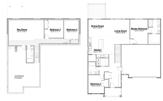
Main Floor: 1524 Sq Ft Lower Level: 899 Sq Ft Total: 2423 Sq Ft