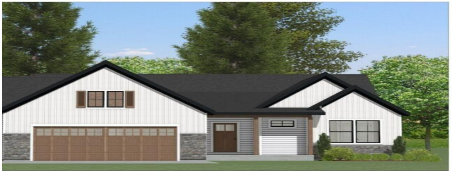
The Brookvale by Bruyn Homes Front Elevation - Option #2

© BRUYN HOMES. USE OR REPRODUCTION WITHOUT PERMISSION IS PROHIBITED.