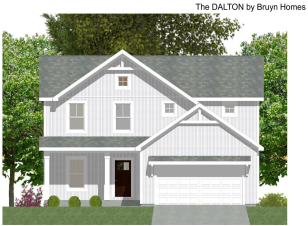
Dalton Elevation D