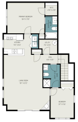
TOTAL: 1193 sq. ft. Apartment: 67 sq. ft., 1st Floor: 1028 sq. ft. EXCLUDED AREA: GARAGE: 463 sq. ft., WALLS: 125 sq. ft.

Experience effortless living in this immaculate, move-in-ready end-unit at Rosewood Village. Perched on the second floor for added privacy, this home backs directly onto a serene canopy of mature trees. The heart of the home is a sun-drenched great room boasting vaulted ceilings. The seamless flow leads you into an updated kitchen featuring granite countertops, [...]