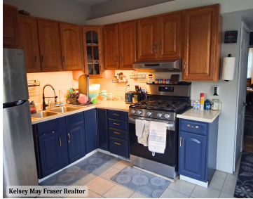
Kelsey May Fraser Realtor

Welcome to 317 Brown St. SE! Nestled among the trees, you are sure to love this beautifully inviting 6-bedroom, 2 full bath home in the heart of Grand Rapids. The cozy, light-filled living room flows into the formal dining room with easy access to the kitchen, perfect for entertaining. The recently renovated kitchen includes a [...]