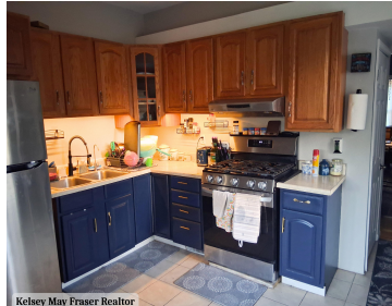
Kelsey May Fraser Realtor

Welcome to 317 Brown St. SE! Nestled among the trees, you are sure to love this beautifully inviting 6-bedroom, 2 full bath home in the heart of Grand Rapids. The cozy, light-filled living room flows into the formal dining room with easy access to the kitchen, perfect for entertaining. The recently renovated kitchen includes a [...]