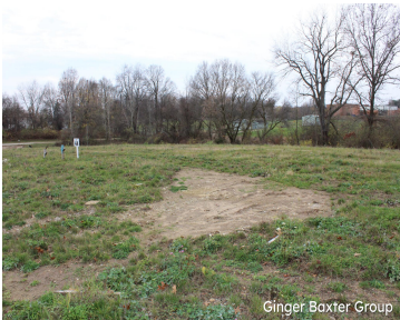
Ginger Baxter Group