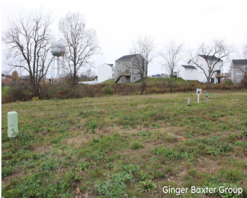
Ginger Baxter Group