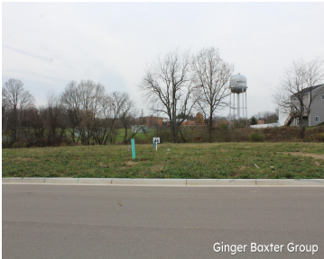
Ginger Baxter Group

A great lot in the Village of Middleville. Thornapple Kellogg schools. Great views for a great price. Reserved for Interra Homes.