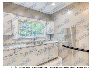
Kitchen v1 (7 x 10) Vinyl Flooring, Top & Bottom Cabinets, Plenty Counter Space