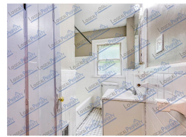
Bathroom v2: New Vanity, Modern Flooring, and Stylish Fixtures

Front Porch, Stove, Fridge, Shared Backyard, Private Access www.LogicalPM.com