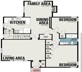
3288 CHESTNUT AVE SW - SECOND FLOOR