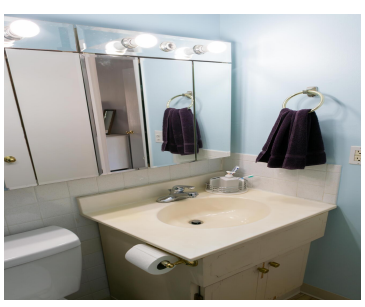
2 bed 1.5 bath cozy 2 story condo close everything! K College and Western Campus are moments away. Enjoy a quiet, tucked away condo just moments away from downtown Kalamazoo and so much more!