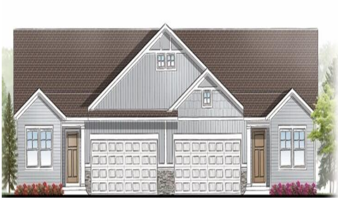
Jason Ridge - 2-Unit