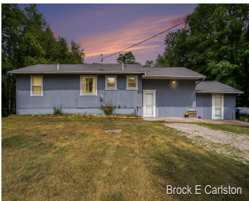
Brock E Carlston

Spacious 4-bedroom, 3 full bath home with a full walk-out basement, offering plenty of space and functionality for any lifestyle! Enjoy cooking in the large kitchen featuring abundant storage, perfect for entertaining or everyday living. Relax in the bright living spaces with updated vinyl replacement windows throughout. Efficient heating with a 2019 furnace and cozy [...]