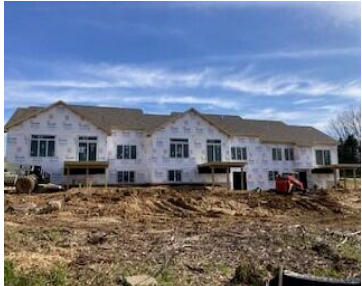
BRISTOL 2 BEDROOM, 2 BATH