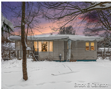
Brook E Carlston

This beautifully updated 3-bedroom, 1-bath home offers a blend of comfort, efficiency, and modern convenience, and qualifies for Rural Development financing, all within the desirable Ravenna School District. Inside, you'll appreciate the thoughtful upgrades including a kitchen remodel planned for fall of 2025, smart switches, a smart thermostat, and a wood-burning system (wood stove ready) [...]