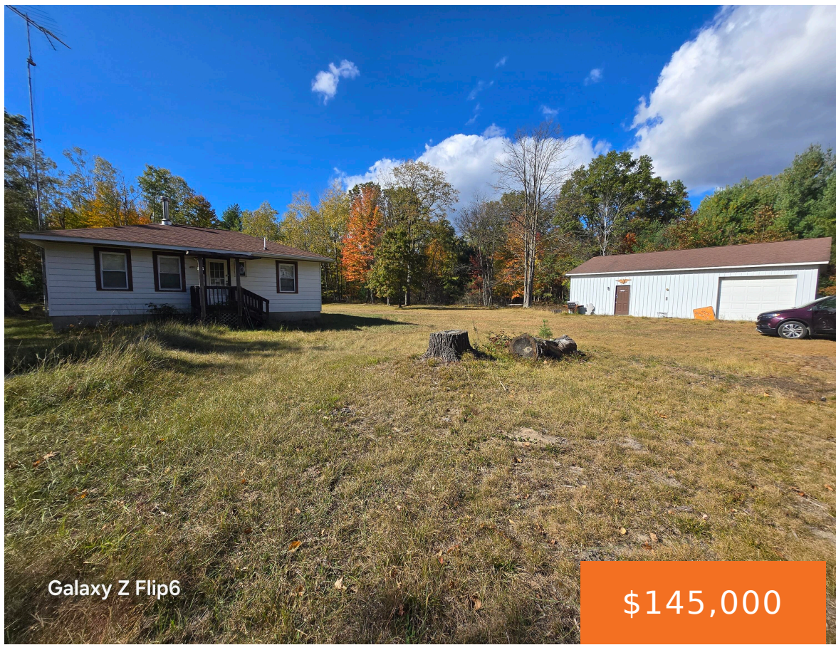
Galaxy Z Flip6