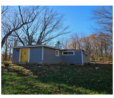
Sight unseen...REO AS-IS Purchase