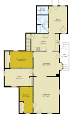
Total: 1456 sq. ft Basement: 0 sq. ft, 1st Floor: 1456 sq. ft Excluded Areas: Basement: 606 sq. ft, Deck: 42 sq. ft, Walls: 153 sq. ft

Looking for easy, single-level living? This 3-bedroom, 1-bath ranch-style home is the perfect blank canvas for your starter home dreams or your next rewarding investment project. Nestled perfectly between Coldwater & Hillsdale for an easy daily commute. Month-to-month tenants currently occupy this home.