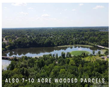
ALSO 7-10 ACRE WOODED PARCELS