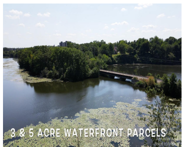
3 & 5 ACRE WATERFRONT PARCELS