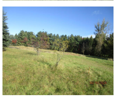
great spot to build your dream home on 1.66 acres cleared lot with woods lining the back of the property